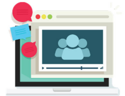
virtual chapter meeting